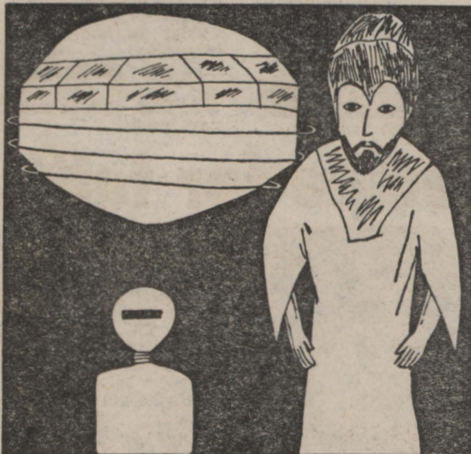
ALAN'S rough sketches show (top left) the "space-ship" he saw, (bottom left) one of the "lamp-headed robots" and (right) the alien called "Joseph."

But later he discovered that four police officers at nearby Halifax had reported a UFO at much the same time—a very bright, steel blue light which moved first north-south then east-west.